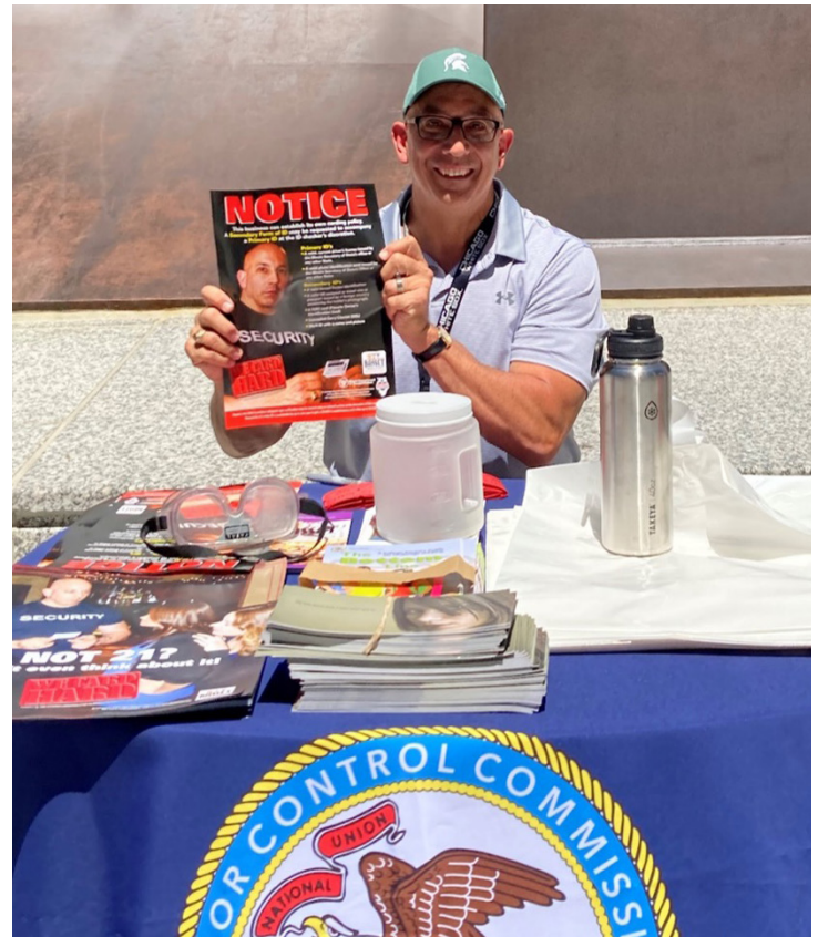
AAIM for the Community Event